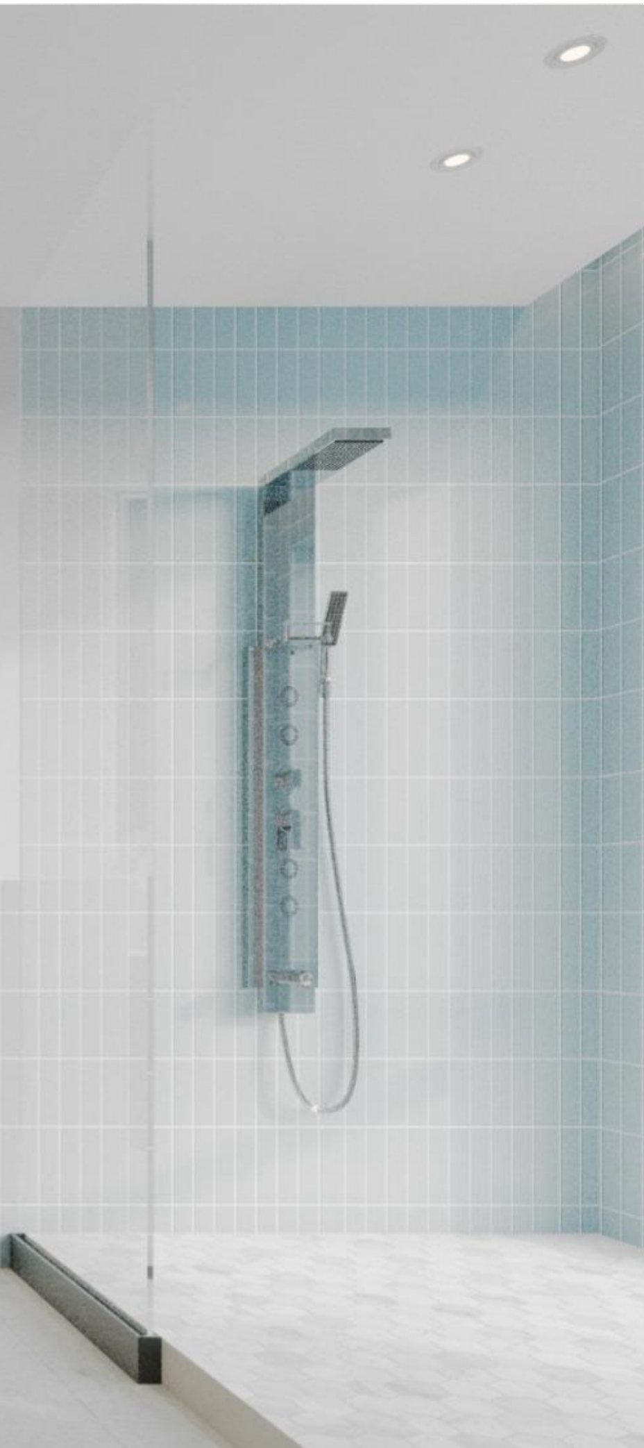
A modern sanctuary. The Residences' baths are adorned with designer tile and extra-wide vanities.